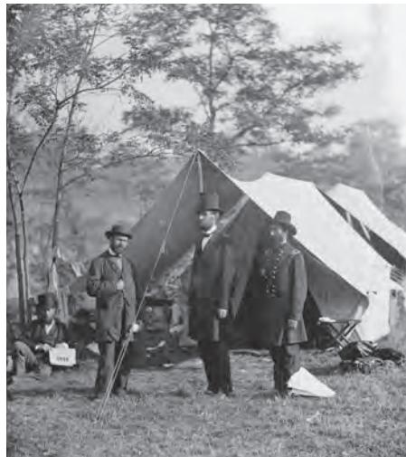
Lincoln at Antietam