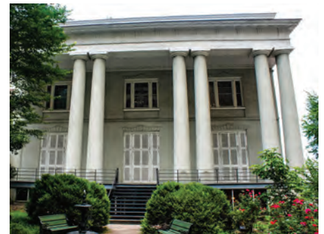
Confederate White House, Richmond

Itinerary subject to change. Meals in bold included in the price of the tour.