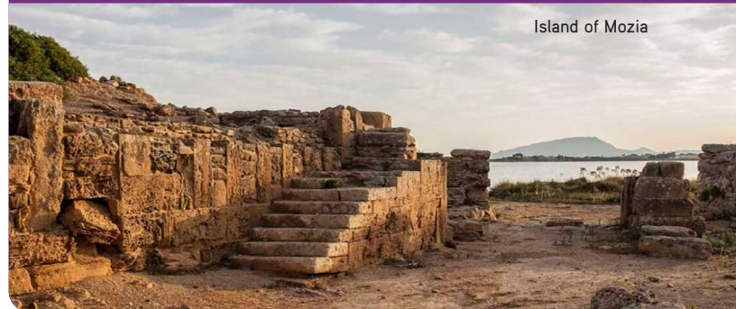
Island of Mozia

The Sicily tour is an exclusive presentation by the Vassar Travel Program, and is organized by THE GRAND TOUR Travel Company, Peterborough, New Hampshire.