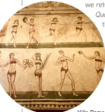
Villa Romana del Casale

The evening in Palermo is free. The hotel concierge and TGT staff will be available to advise on dining options in the area.