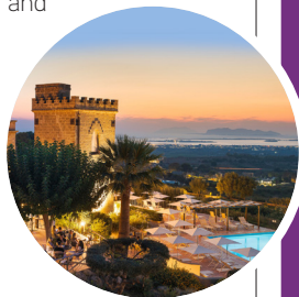
Baglio Oneto dei Principi

We begin our tour of Syracuse with a walk through Ortigia, including a guided visit of the 7th century cathedral, another UNESCO World Heritage site, whose original structure incorporated an ancient Doric temple mentioned by Plato. After lunch in the area, we'll tour Castello Maniace, a citadel at the southern tip of Ortigia considered a masterpiece of medieval military architecture and offering breathtaking views of the harbor. The evening in Syracuse is free.