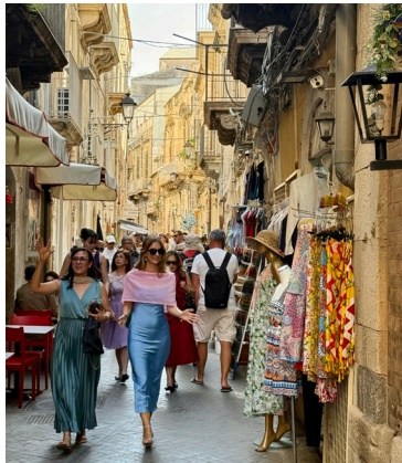
Street in Ortigia