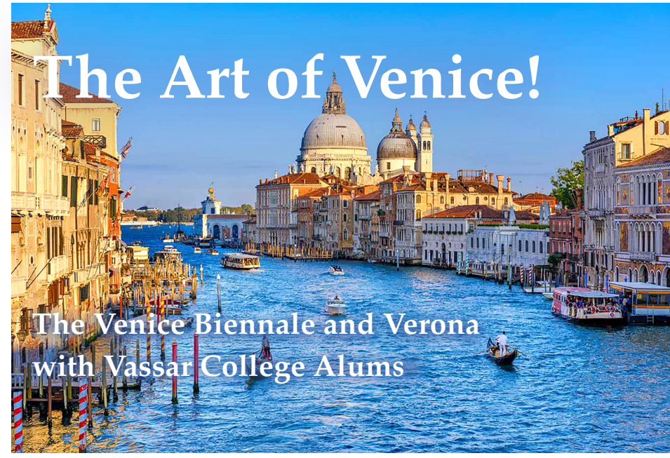
Grand Canal, Venice